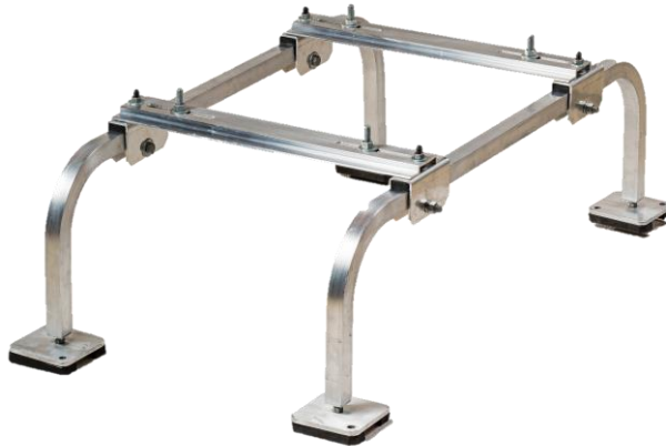
IBEX1201 - 12" tall stand, for single fan ductless outdoor units

Our mini split stands are from rust resistant aluminum