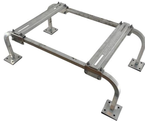
IBEX1202 - 12" tall stand, for dual fan (tall) ductless outdoor units