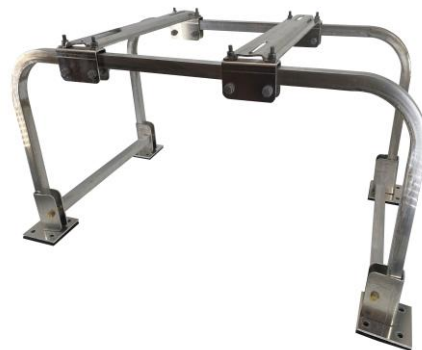
IBEX1802 - 18" tall stand, for dual fan (tall) ductless outdoor units