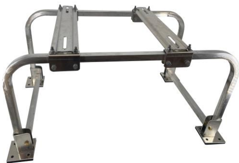
IBEX1801 - 18" tall stand, for single fan ductless outdoor units